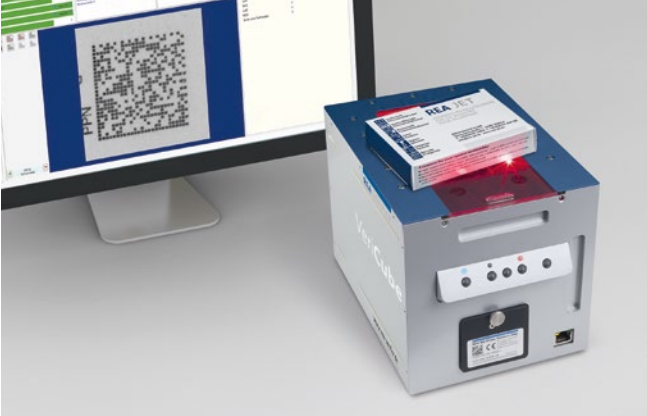
Verification of Data Matrix codes on product packaging