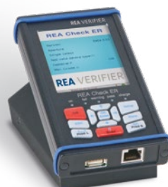
REA Check ER (compact, for barcodes, mobile)