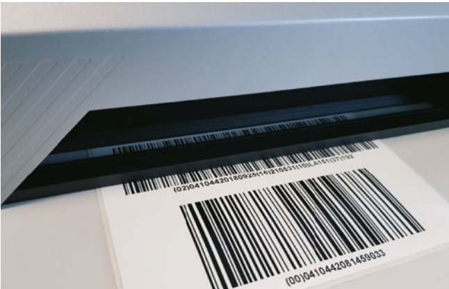
Quality verification of barcodes