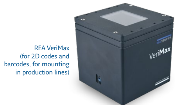
REA VeriMax (for 2D codes and barcodes, for mounting in production lines)