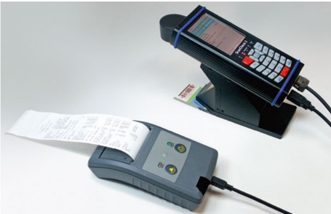
Creation of test protocols