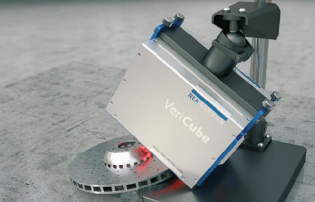
Stand solution for code verification on 3D objects