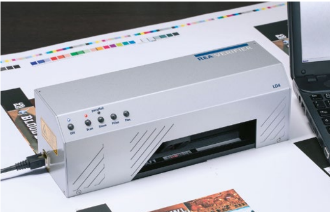
Measuring of barcodes on print sample sheets