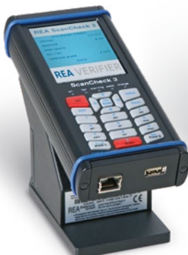
REA ScanCheck 3 (universal, for barcodes, mobile)