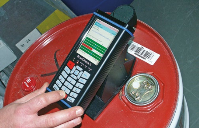
Verifying barcodes on metal barrels