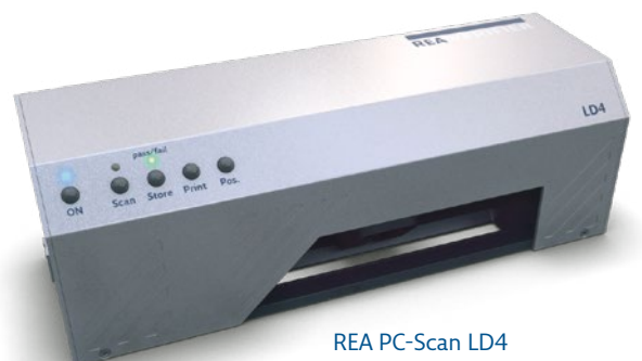
REA PC-Scan LD4 (reference device for barcodes)