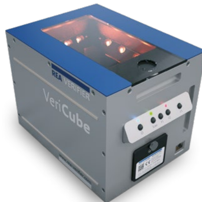
REA VeriCube (for 2D codes and barcodes, ready for 21 CFR Part 11)