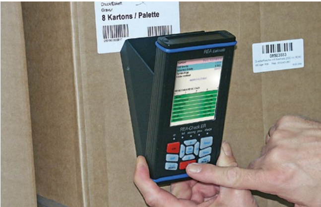
Flexible verification of barcodes on site